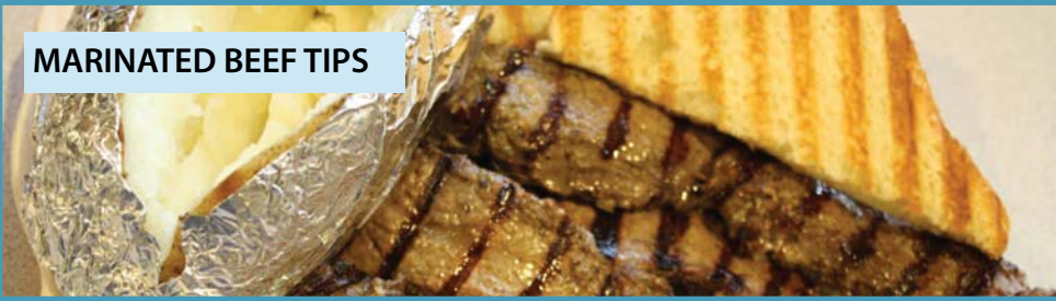
MARINATED BEEF TIPS