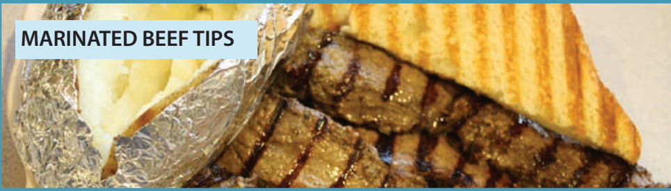
MARINATED BEEF TIPS