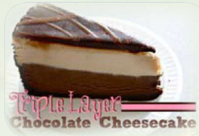
Chocolate Cheesecake - 5.95