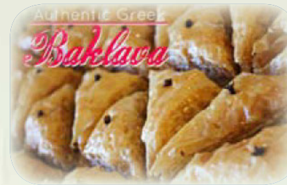
Baklava - 5.95