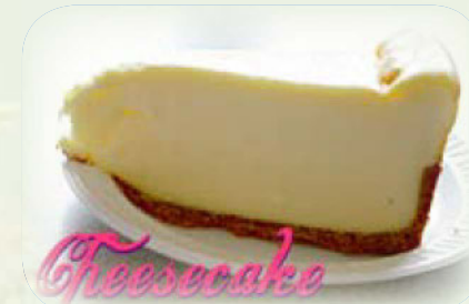
Cheesecake - 5.95