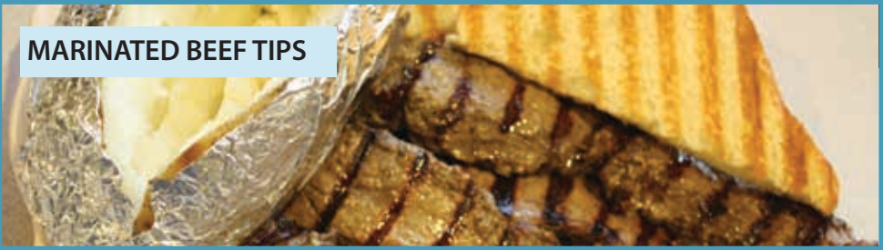
MARINATED BEEF TIPS