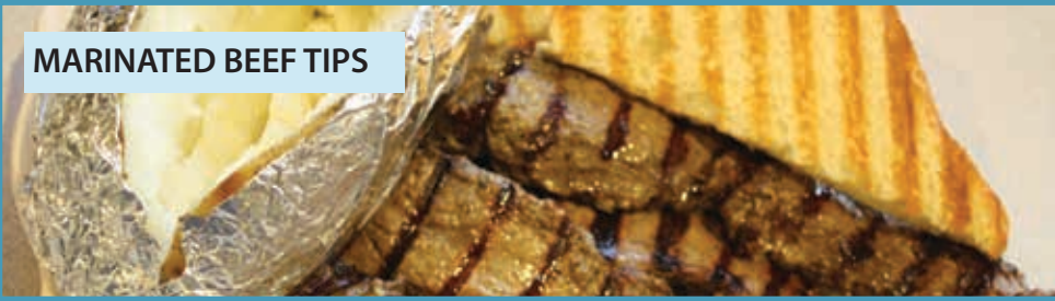
MARINATED BEEF TIPS