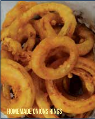
HOMEMADE ONIONS RINGS