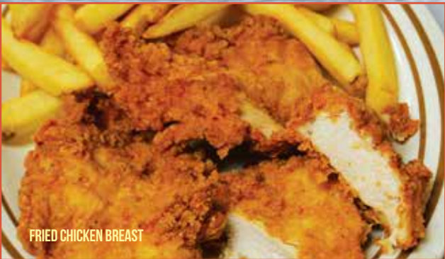
FRIED CHICKEN BREAST