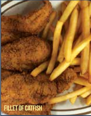
FILLET OF CATFISH