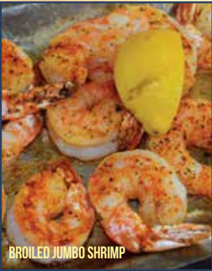
BROILED JUMBO SHRIMP