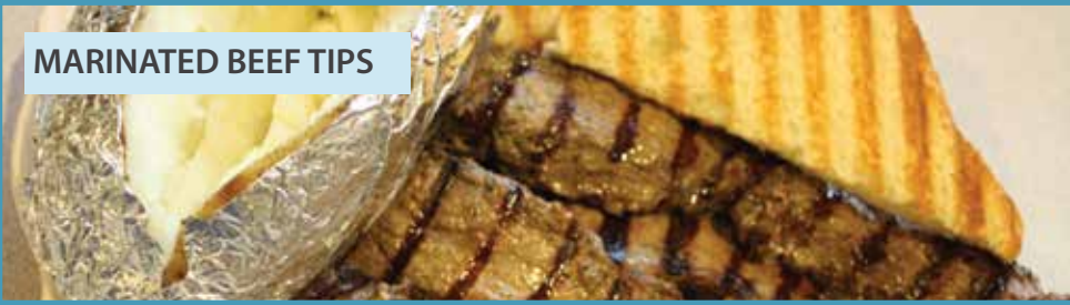
MARINATED BEEF TIPS