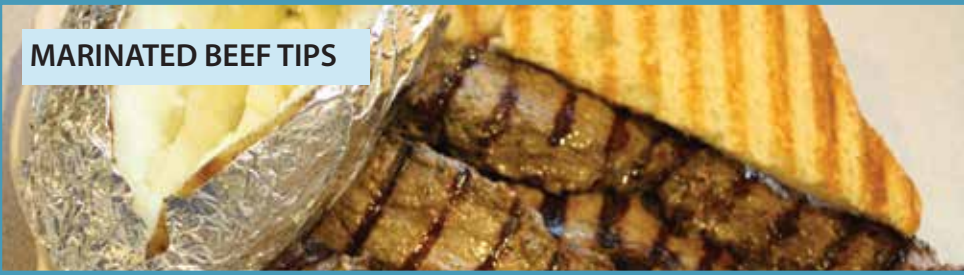
MARINATED BEEF TIPS