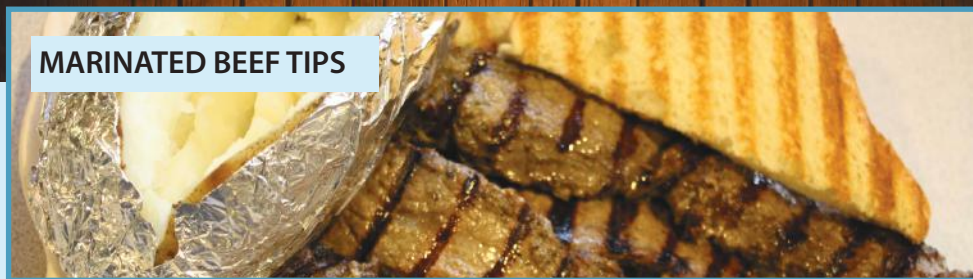
MARINATED BEEF TIPS