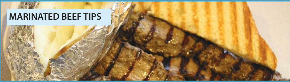
MARINATED BEEF TIPS